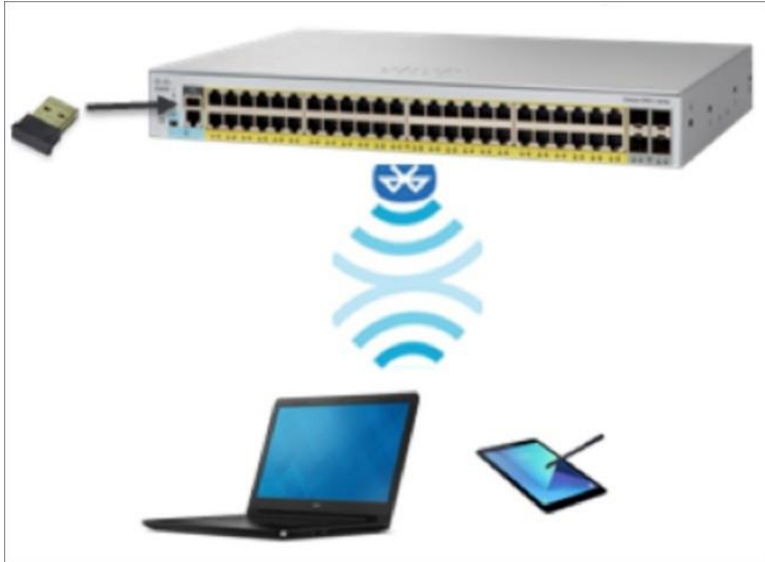
Figure 2. Over-the-air switch access using Bluetooth