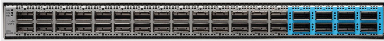
Figure 2. Cisco Nexus 93600CD Switch

The Cisco Nexus 93600CD-GX Switch (Figure 2) is a 1RU switch that supports 12 Tbps of bandwidth and 4.0 bpps across 28 fixed 40/100G QSFP-28 ports and 8 fixed 40/100/400G QSFP-DD ports. The 28 ports support 10/25-Gbps. Please see feature table below for more information.